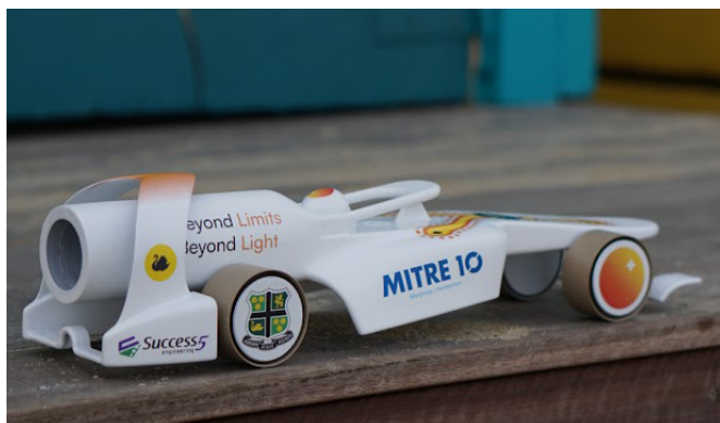
»» Our car @ Brighton 2025 National Finals