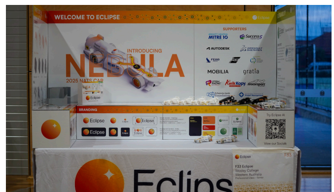
»» Our trade display 2025 National Finals